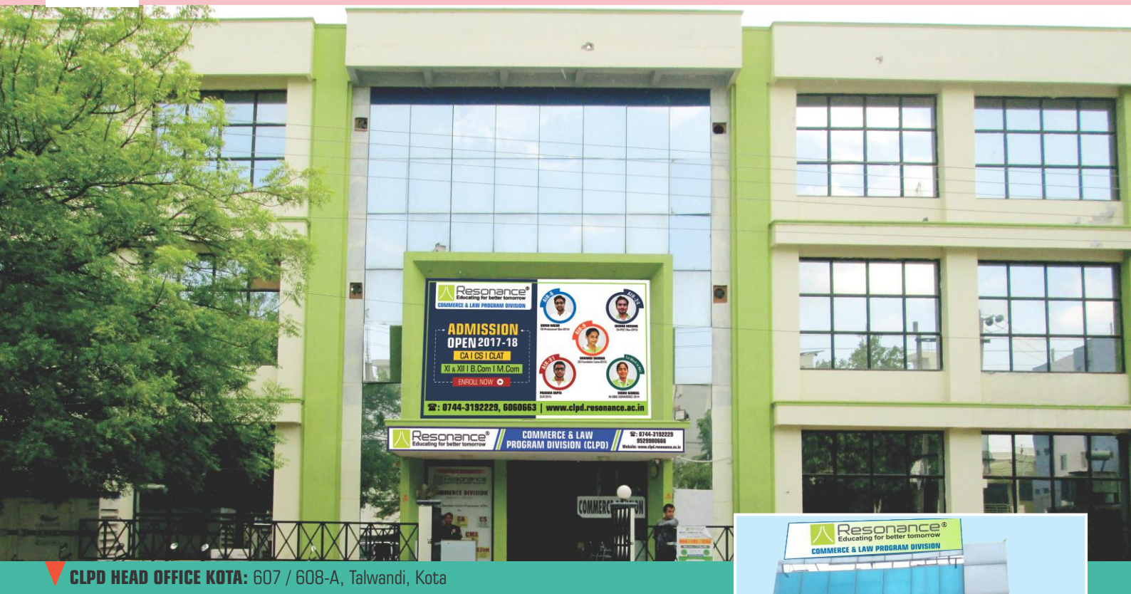
CLPD HEAD OFFICE KOTA: 607 / 608-A, Talwandi, Kota