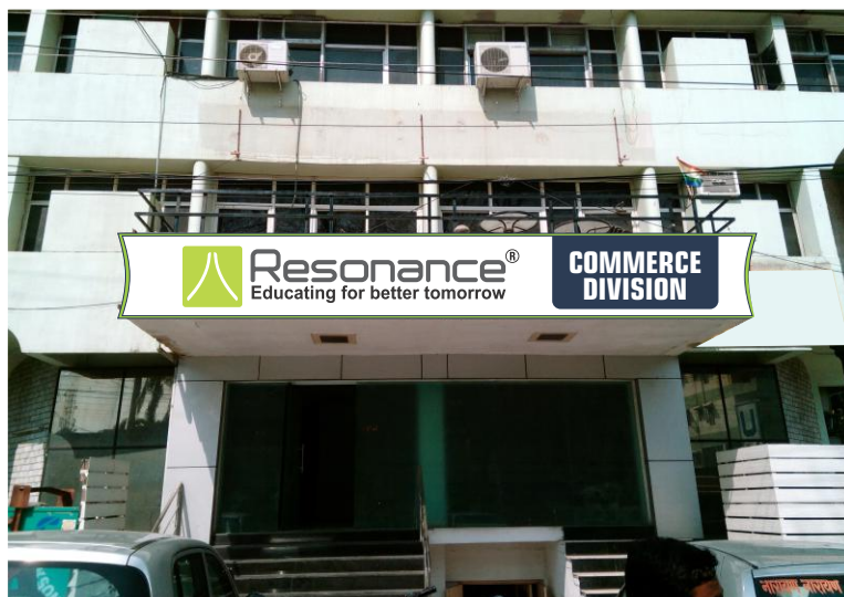
INDORE STUDY CENTRE UV House, Near Jal Sabha Grah, South Tukoganj, Indore