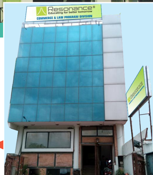
JAIPUR STUDY CENTRE JJ Tower, 5, Kailashpuri, Tonk Road, Jaipur

At Resonance, we are focused on your success. Though change and uncertainty may be ever present, Resonance remains firmly committed to helping students by providing academic services to enable them to meet their career goals and objectives. And with this notion in mind, we have expanded our Commerce & Law Program Division – CLPD to Jaipur & Indore from the Academic Session 2015-16. Now, Commerce Classroom Coaching is being provided by Resonance at KOTA, JAIPUR & INDORE Study Centres.