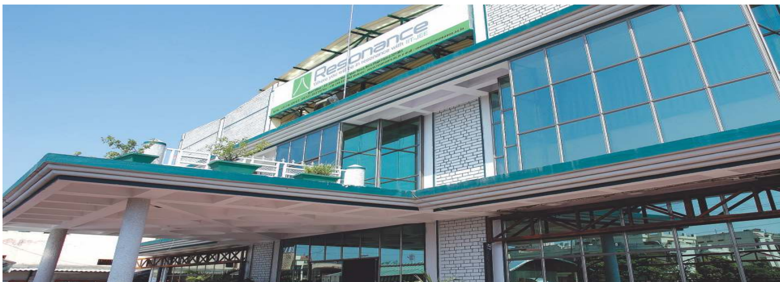
CLPD HEAD OFFICE KOTA: J-2, Jawahar Nagar Main Road, Kota