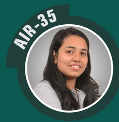
FEMINA JAIN CA-Intermediate (Nov.-2019)