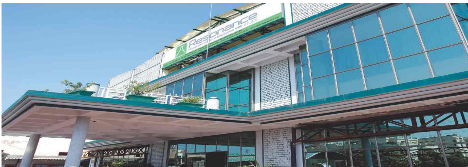
CLPD HEAD OFFICE KOTA: J-2, Jawahar Nagar Main Road, Kota